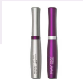
Lash Duo Collection