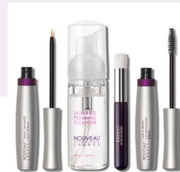
Complete Lash Essential Collection