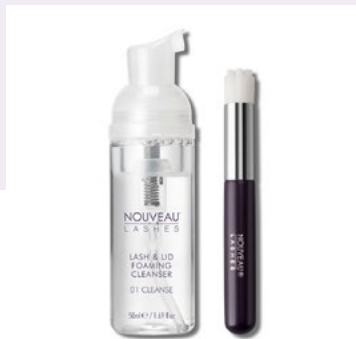
Lash & Lid Cleanser Set

To help you get the perfect lash care routine, we've created a range of handy bundles with the ultimate product combinations.