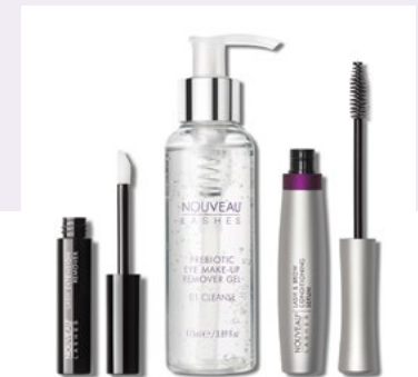
Complete Lash Removal Collection